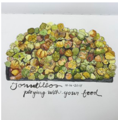
Molly Q., Tomatillos

There are so many possibilities for things to draw. The class touched upon drawing fresh fruits and vegetables, drinks, packaging, groupings and displays of food, recipes and then finally documenting