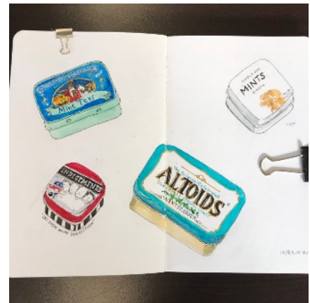
Hilary B., Collection of Tins